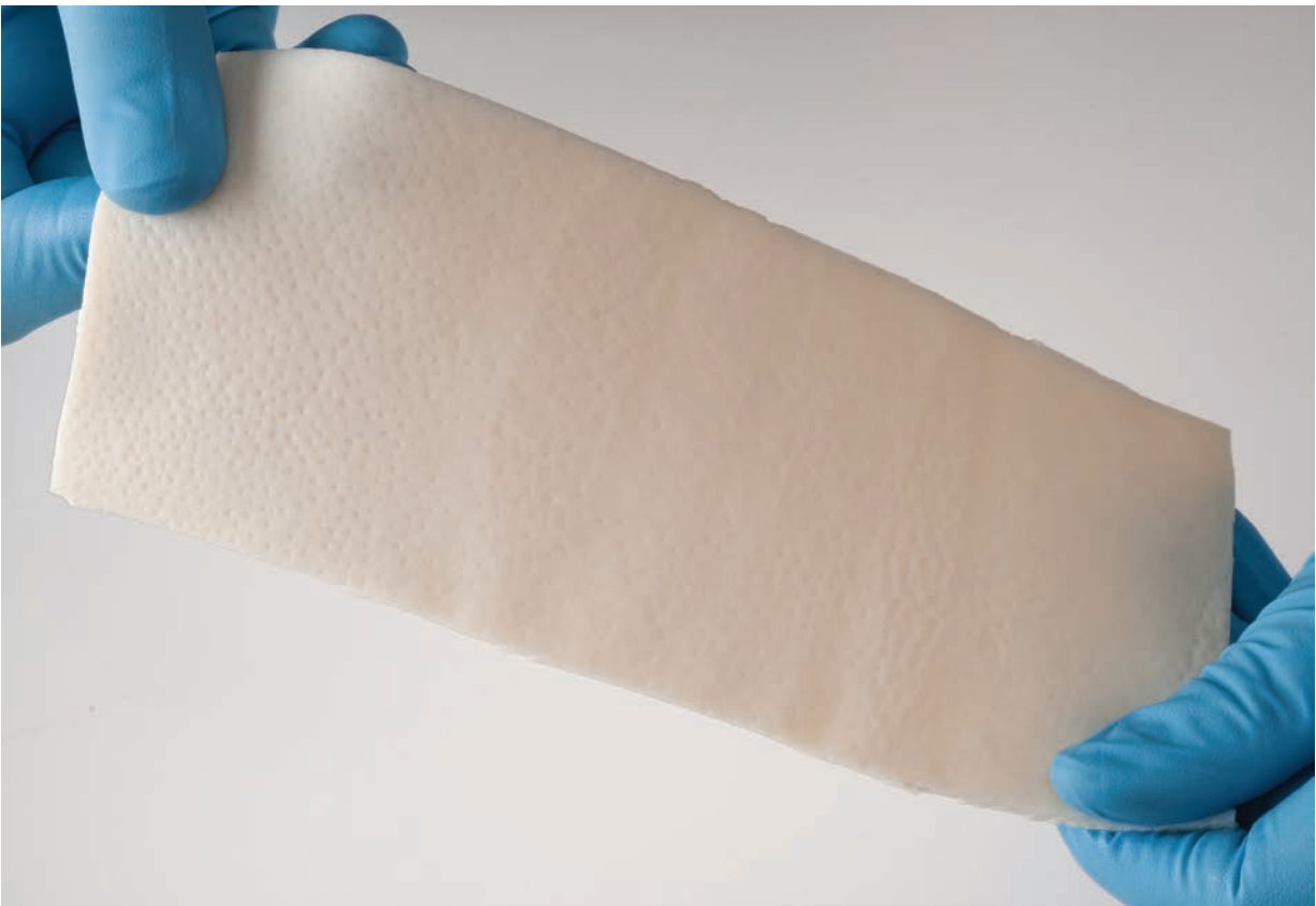
Figure 1. ProLayer ADM Tissue

Suture retention strength is the maximum pulling force (N) on a suture that a tissue can bear at the point of suture before the suture tears through the tissue. Since ProLayer is offered in multiple thicknesses (Medium, Thick and Extra Thick configurations—M, T and XT respectively) this measurement was standardized to reflect the strength (N) per mm thickness of the tissue.